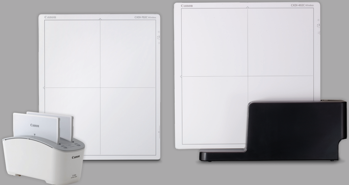
Detectors shown with optional Battery Charger and Docking Station, both sold separately from the Detector.